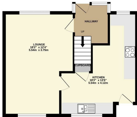
GROUND FLOOR 428 sq.ft. (39.7 sq.m.) approx.