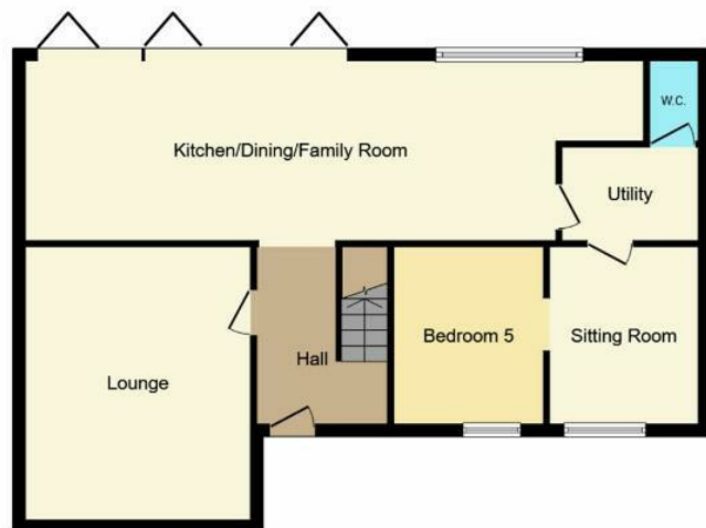
Ground Floor Floor area 79.5 sq.m. (856 sq.ft.)