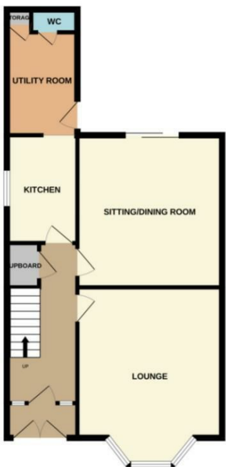
GROUND FLOOR 554 sq.ft. (51.2 sq.m.) approx.