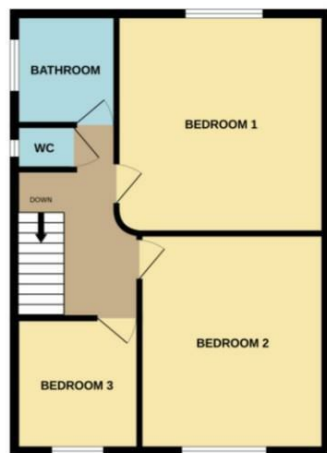
1ST FLOOR 362 sq.ft. (33.5 sq.m.) approx.