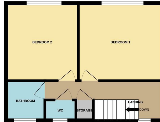
FIRST FLOOR 405 sq.ft. (37.7 sq.m.) approx.