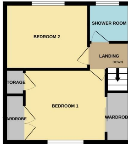
1ST FLOOR 347 sq.ft. (32.3 sq.m.) approx.