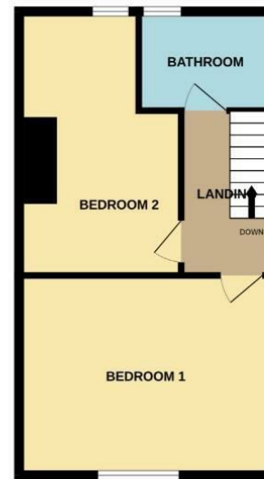
TOTAL FLOOR AREA: 892 sq.ft. (82.9 sq.m.) approx.

Whilst every attempt has been made to ensure the accuracy of the floorplan contained here, measurements of doors, windows, rooms and any other items are approximate and no responsibility is taken for any error, omission or mis-statement. This plan is for illustrative purposes only and should be used as such by any prospective purchaser. The services, systems and appliances shown have not been tested and no guarantee as to their operation or efficiency can be given. Made with Metropix 6/2024.