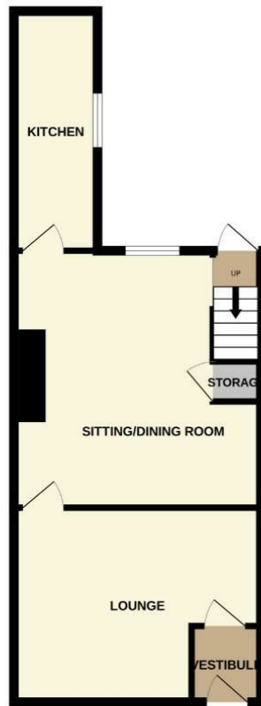
GROUND FLOOR 484 sq.ft. (45.0 sq.m.) approx.