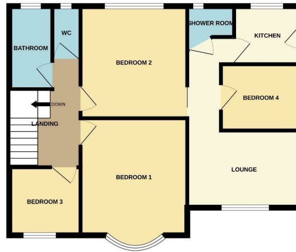
1ST FLOOR 663 sq.ft. (61.6 sq.m.) approx.