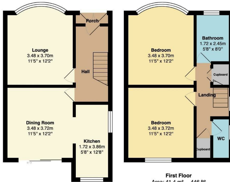
Ground Floor Area: 43.2 m 2 ... 465 ft 2