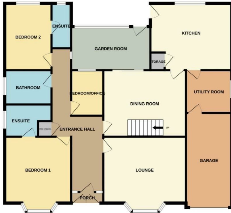
GROUND FLOOR 1514 sq.ft. (140.7 sq.m.) approx.