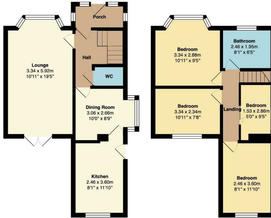
Ground Floor Area: 46.9 m 2 ... 505 ft 2