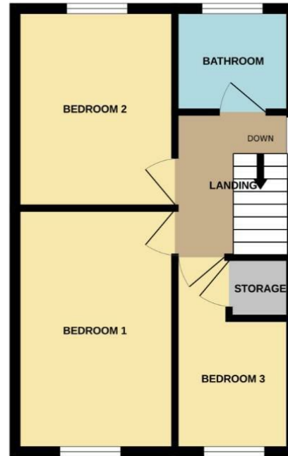
1ST FLOOR 363 sq.ft. (33.7 sq.m.) approx.