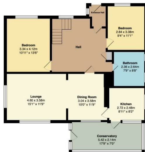
Ground Floor Area: 100.5 m 2 ... 1082 ft 2