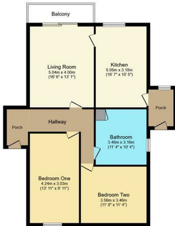
Floor Plan Floor area 96.2 m 2 (1,035 sq.ft.)