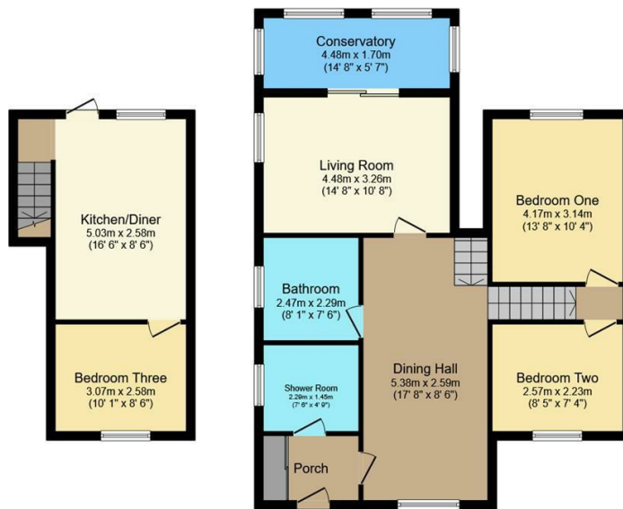
Lower Ground Floor Floor area 26.1 m 2 (281 sq.ft.)