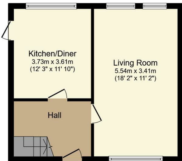
Ground Floor Floor area 39.0 sq.m. (420 sq.ft.)