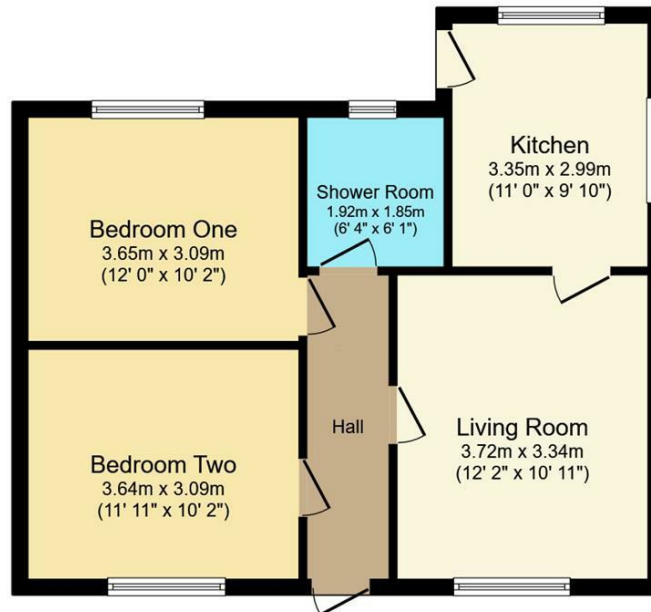
Floor Plan Floor area 71.2 m 2 (766 sq.ft.)