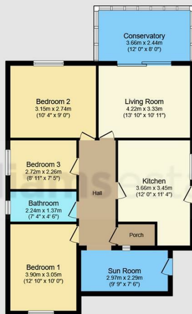
Floor Plan Floor area 97.2 m 2 (1,046 sq.ft.)