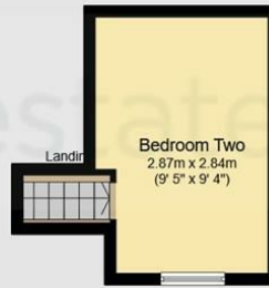
First Floor Floor area 16.1 m 2 (173 sq.ft.)