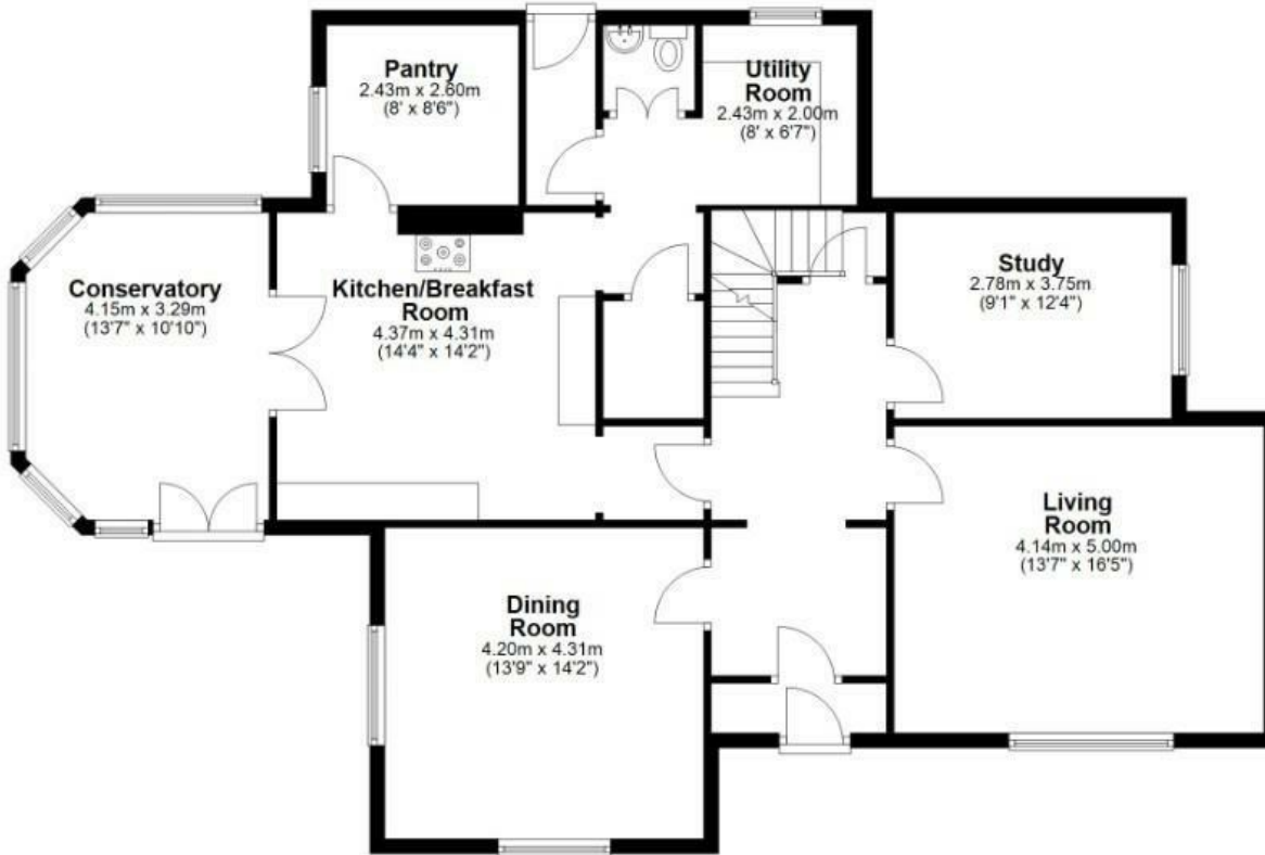
Ground Floor Approx. 130.3 sq. metres (1403.0 sq. feet)