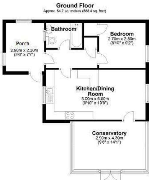
Total area: approx. 54.7 sq. metres (588.4 sq. feet) Little Homefield