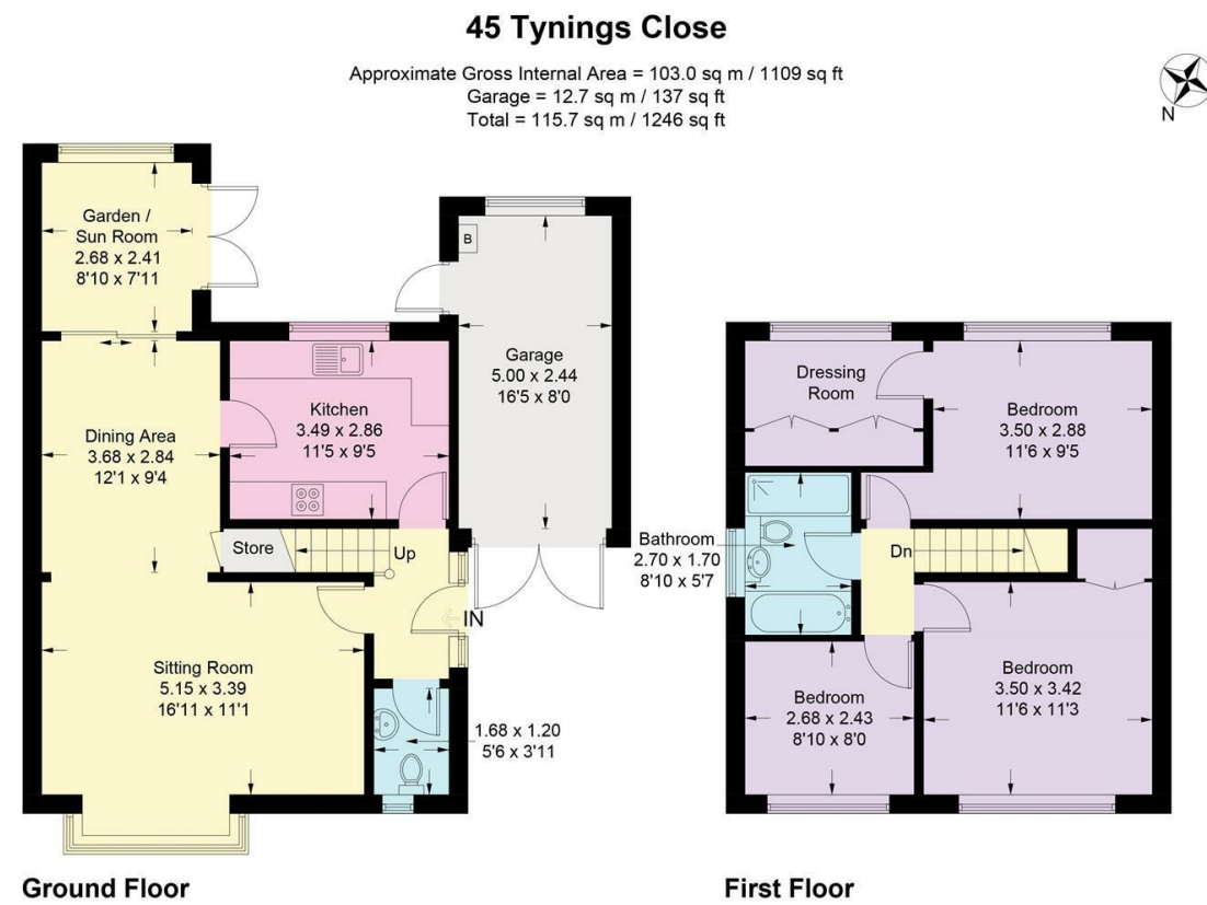
Illustration for identification purposes only, measurements are approximate, not to scale. floorplansUsketch.com © (ID1060644)