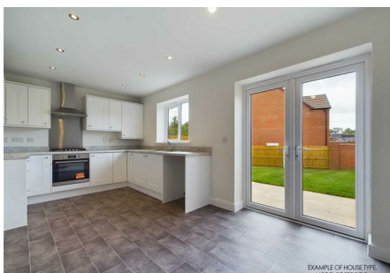
EXAMPLE OF HOUSE TYPE NOT AN OFFER OF PROPERTY

The Mytton is a three-bedroom semi-detached property, extending to approx 963 sq ft, from Shropshire Homes' Legacy Collection, boasting a private driveway for two cars, En-Suite to Bedroom One, and open-plan kitchen/dining room with double doors out to the private garden, situated within a brand new development on the edge of the north Shropshire town of Ellesmere.