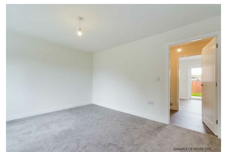
EXAMPLE OF HOUSE TYPE NOT AN OFFER OF PROPERTY