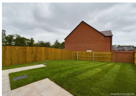
EXAMPLE OF HOUSE TYPE NOT AN OFFER OF PROPERTY