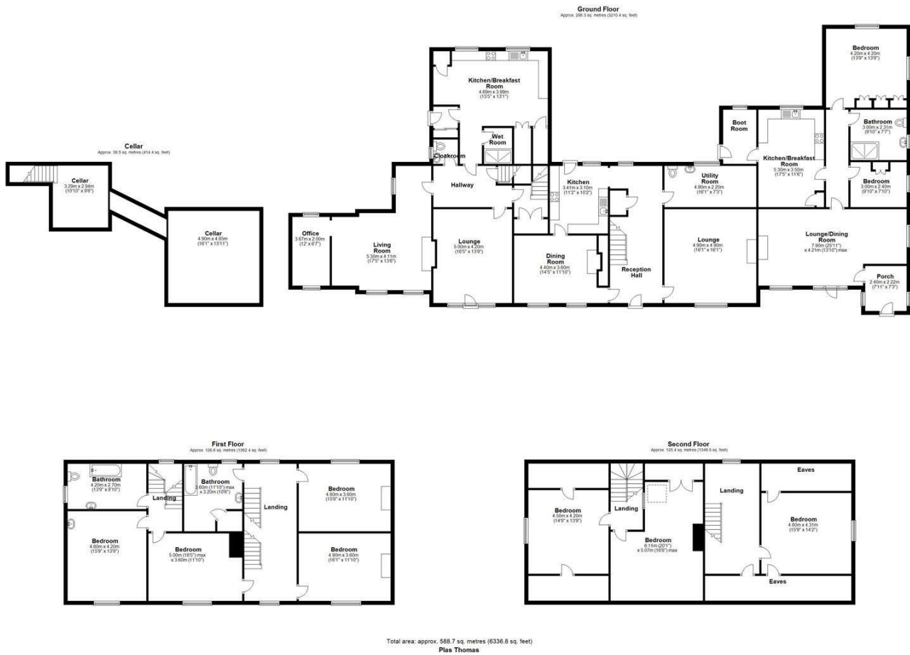
Total area: approx. 588.7 sq. metres (6336.8 sq. feet) Plas Thomas

Property to sell? We would be delighted to provide you with a free no obligation market assessment of your existing property. Please contact your local Halls office to make an appointment. Mortgage/ financial advice. We are able to recommend a completely independent financial advisor,