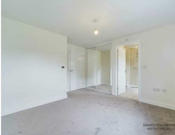
EXAMPLE OF HOUSETYPE NOT PLOTSPECIFIC.