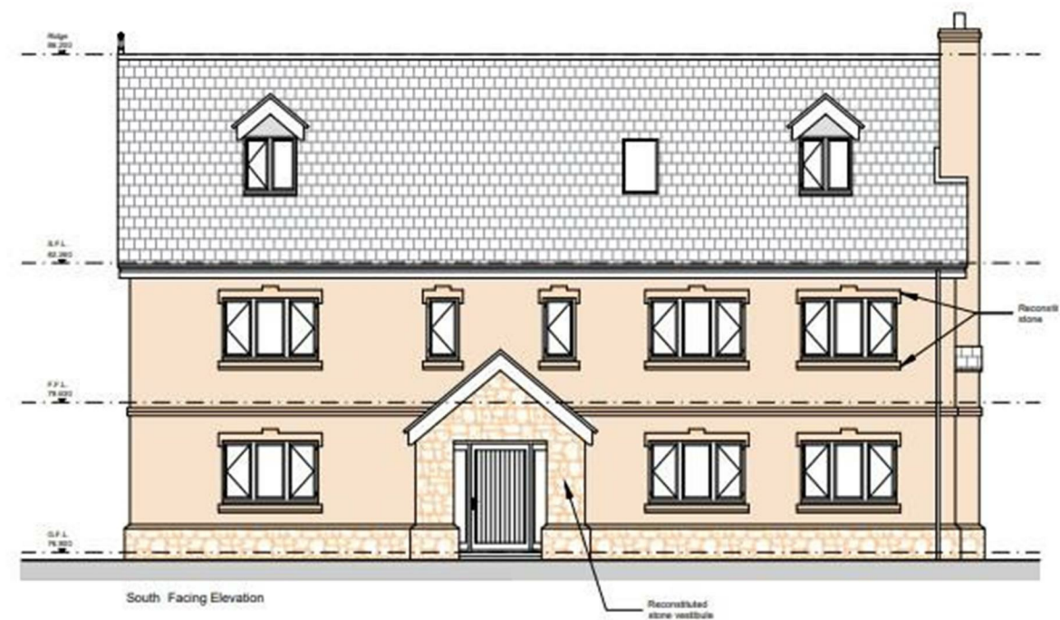
Plot 1 - Elevation