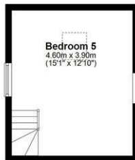
Total area: approx. 264.4 sq. metres (2846.1 sq. feet) The Barn, Sun Bank

Indicative floor plans only - NOT TO SCALE - All floor plans are included only as a guide and should not be relied upon as a source of information for area, measurement or detail.