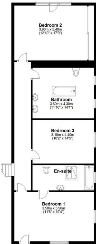
Lower Ground Floor Approx. 94.7 sq. metres (1019.6 sq. feet)