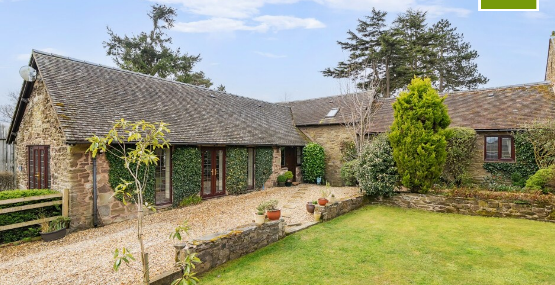
Wain House, Chelmick, SY6 7HA