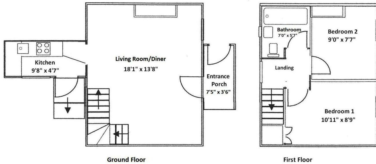
Artists impression, for illustration purposes only. All measurements are approximate. Not to Scale.