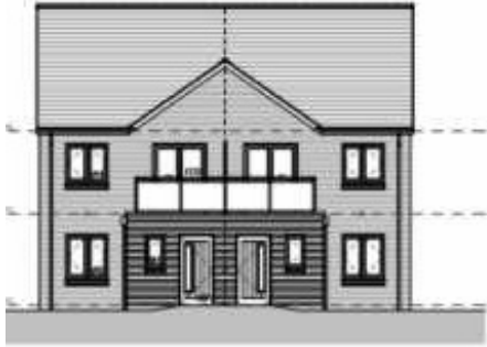
Front Elevation 1:100