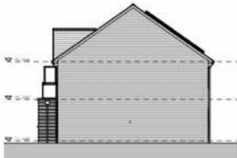
Side Elevation 1:100