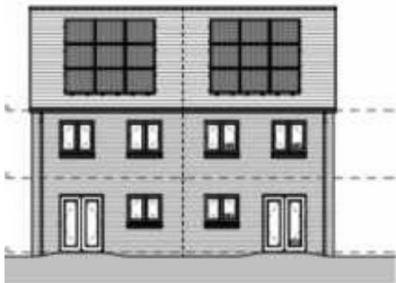
Rear Elevation 1:100