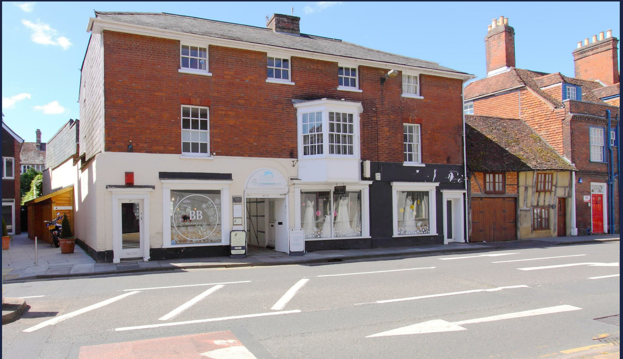
27a New Street, Salisbury