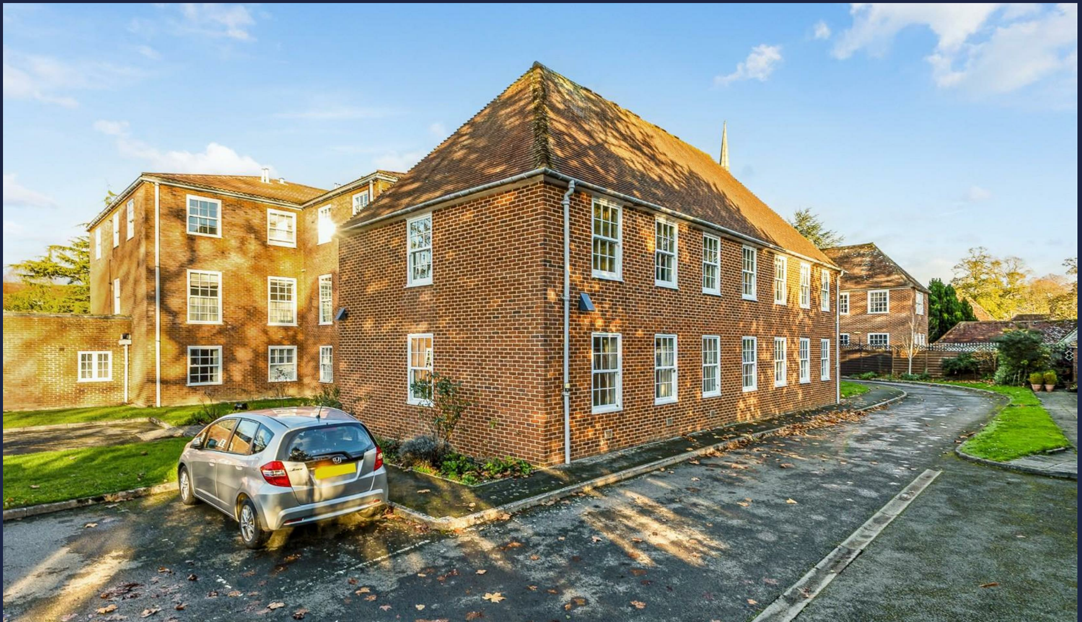
144, The Close, Salisbury