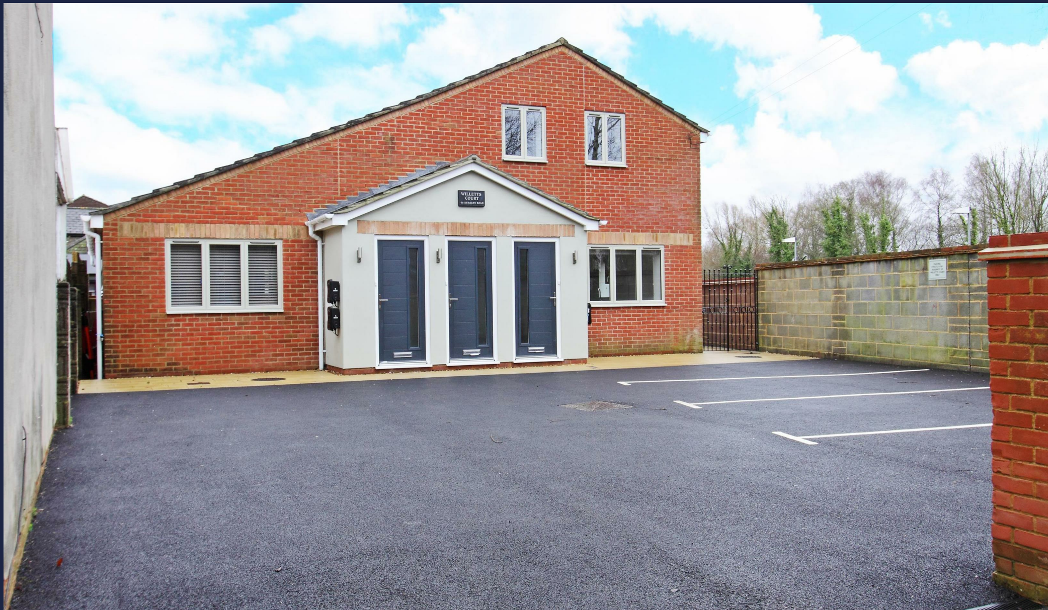
Flat 3, Willetts Court, Salisbury