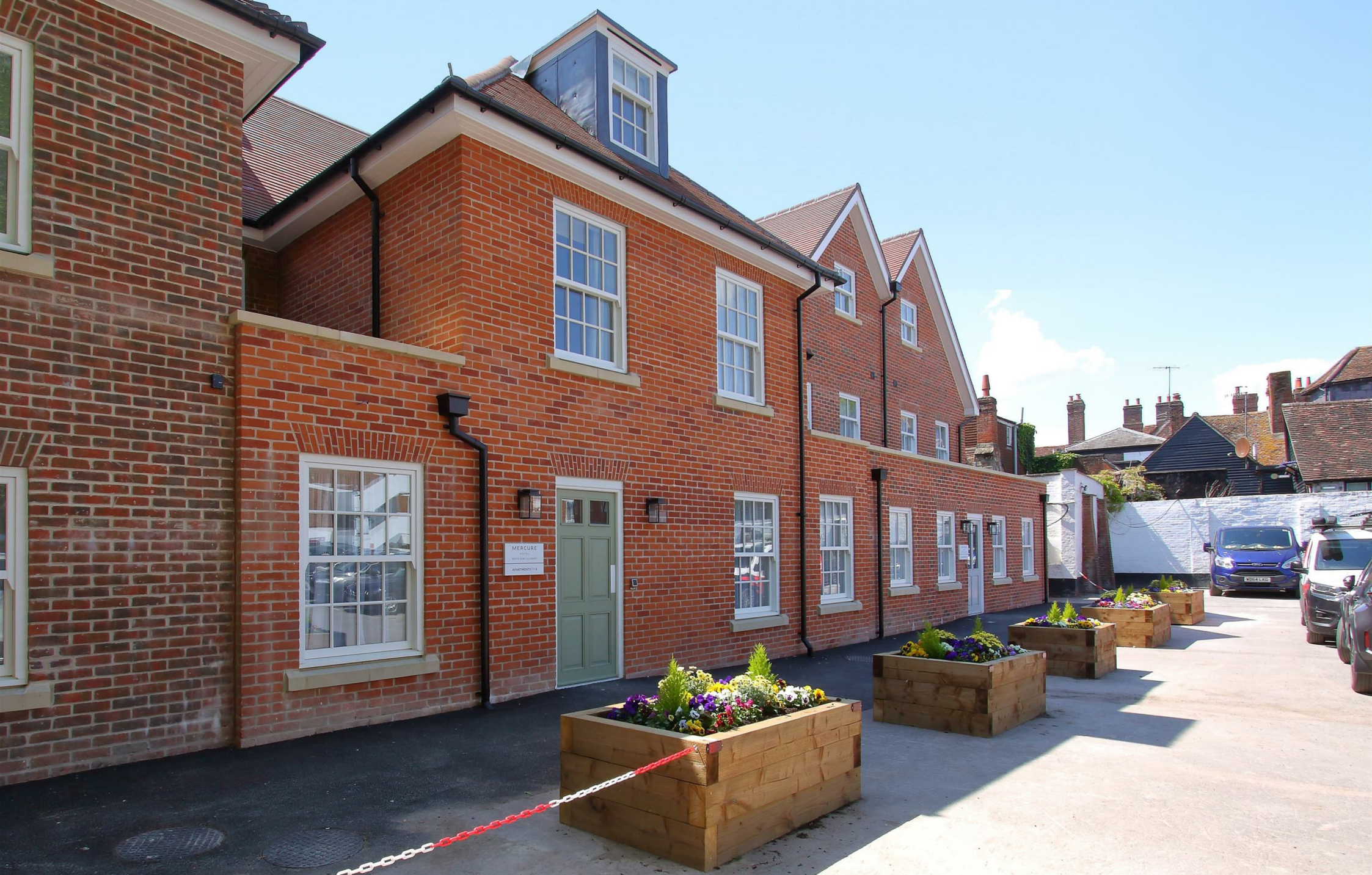
Mecure Salisbury Apartments, 1 St John Street