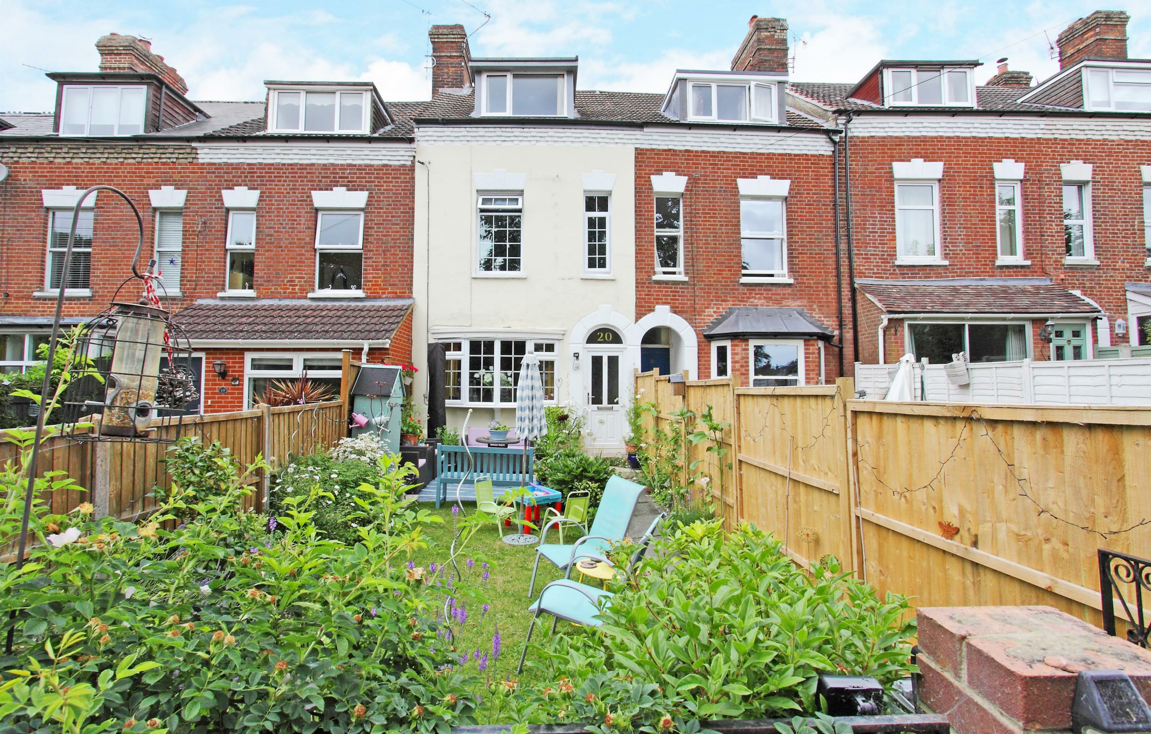
20 Wyndham Terrace, Salisbury