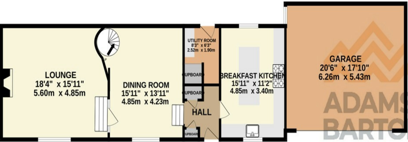
GROUND FLOOR 1130 sq.ft. (105.0 sq.m.) approx.