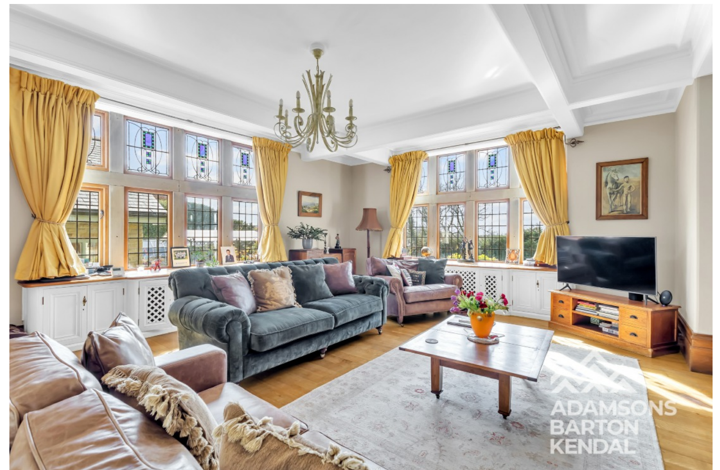
The Pool House, Mayroyd, Norden Road, Bamford OL11 5PT