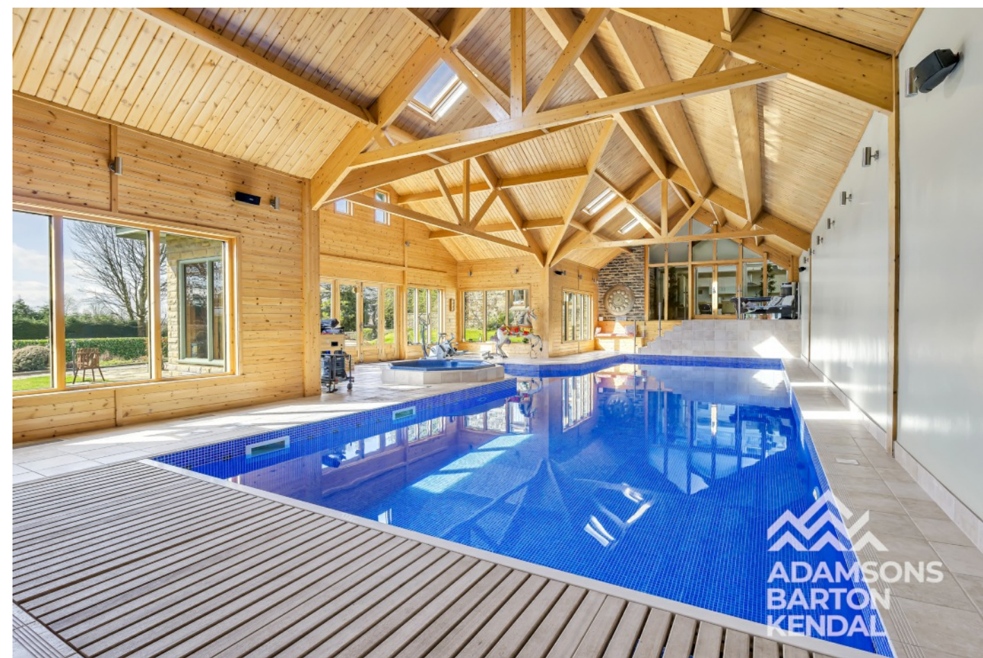
The Pool House, Mayroyd, Norden Road, Bamford OL11 5PT