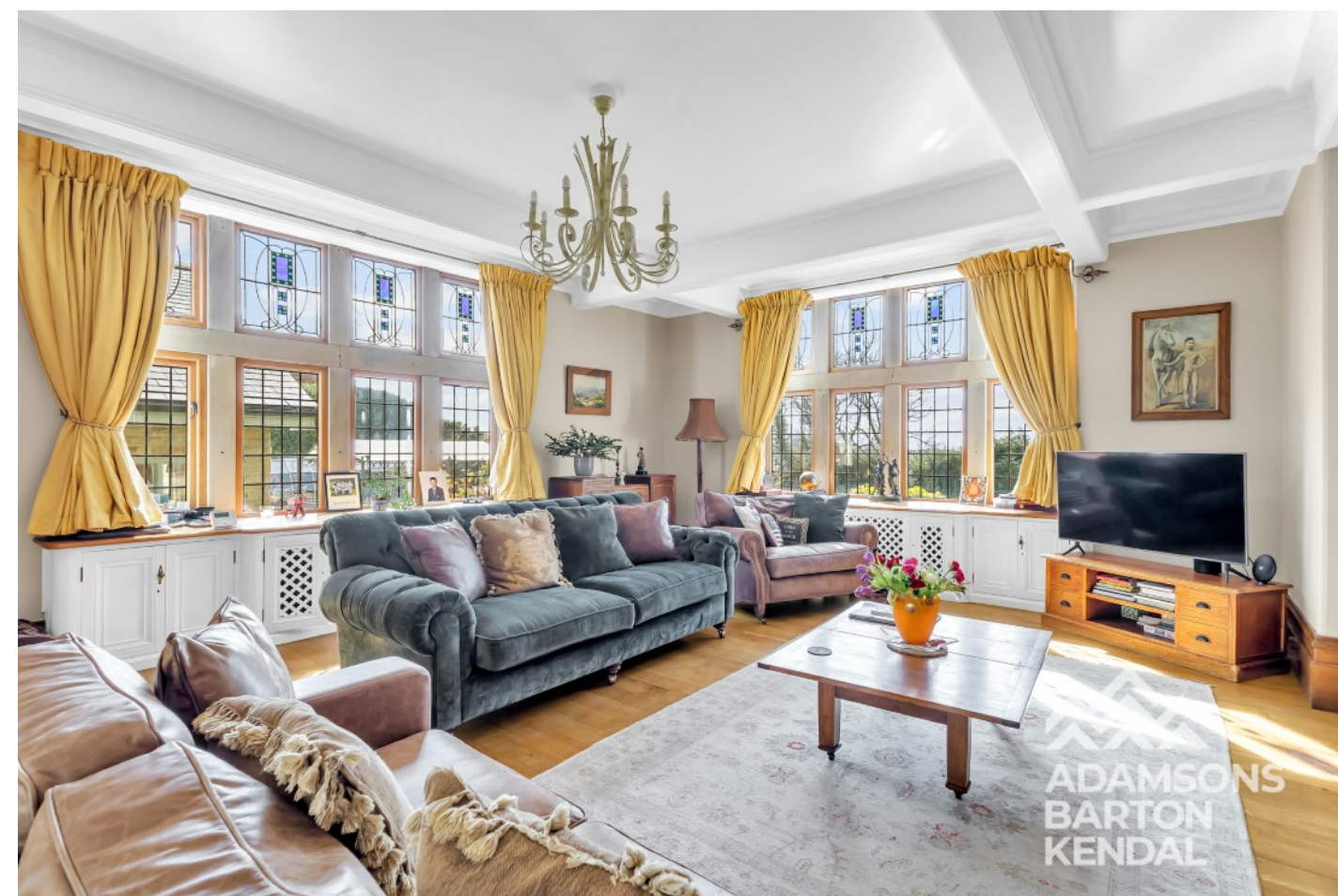
The Pool House, Mayroyd, Norden Road, Bamford OL11 5PT