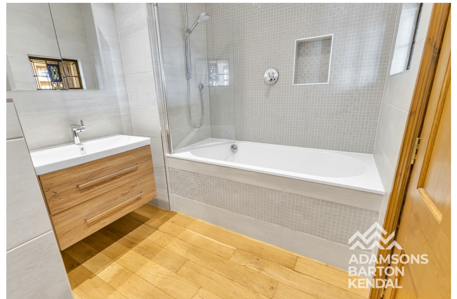
The Pool House, Mayroyd, Norden Road, Bamford OL11 5PT