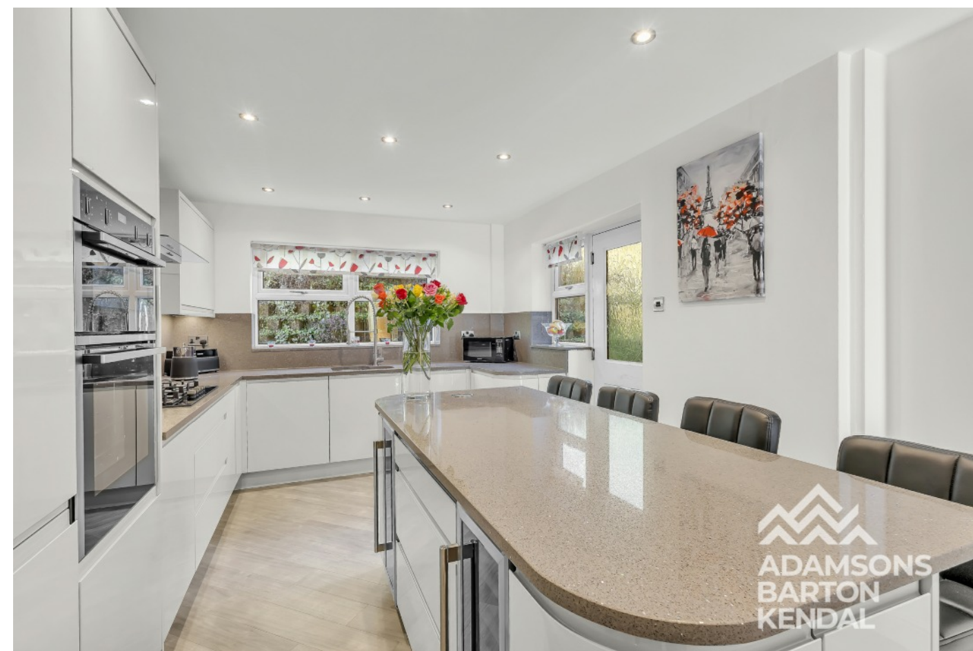
Millbrook Close, Shaw, Oldham OL2 8QA