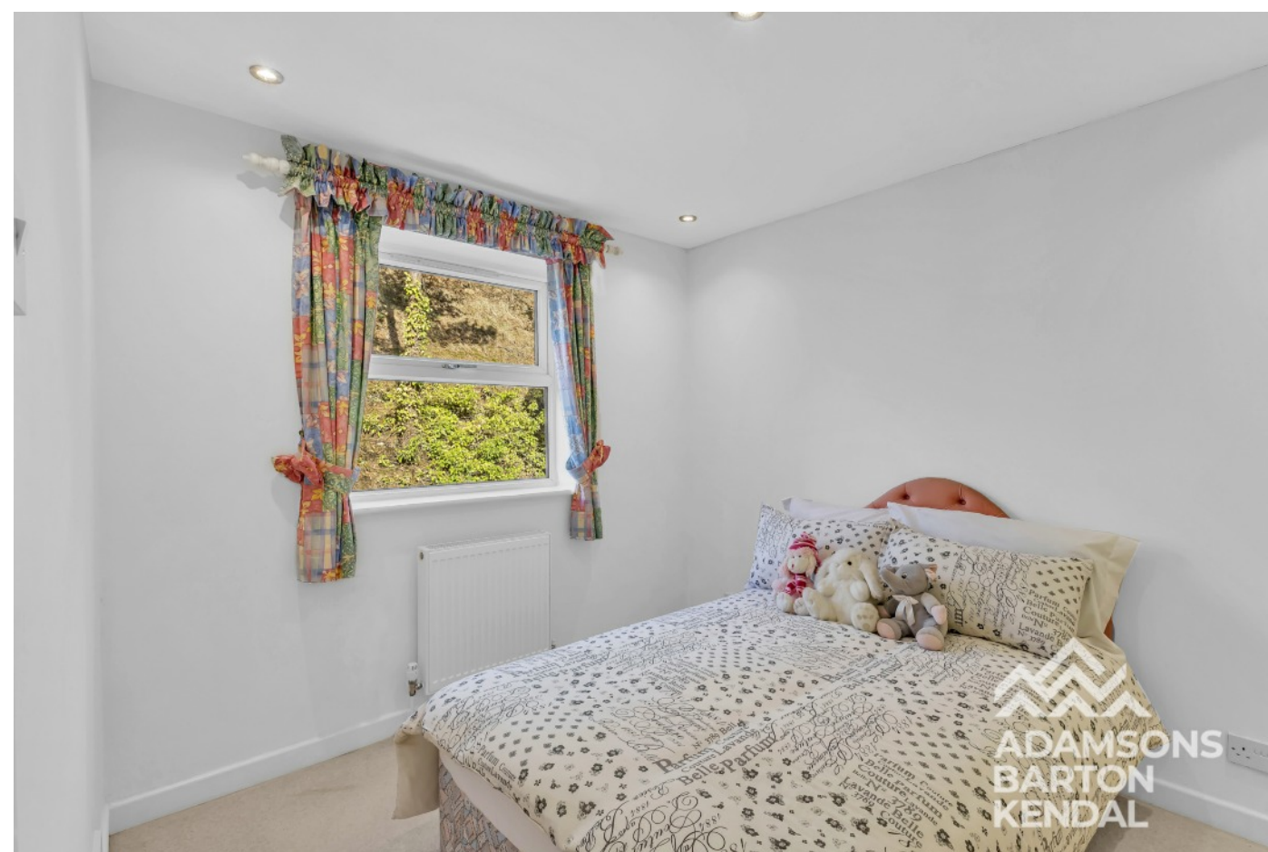
Millbrook Close, Shaw, Oldham OL2 8QA