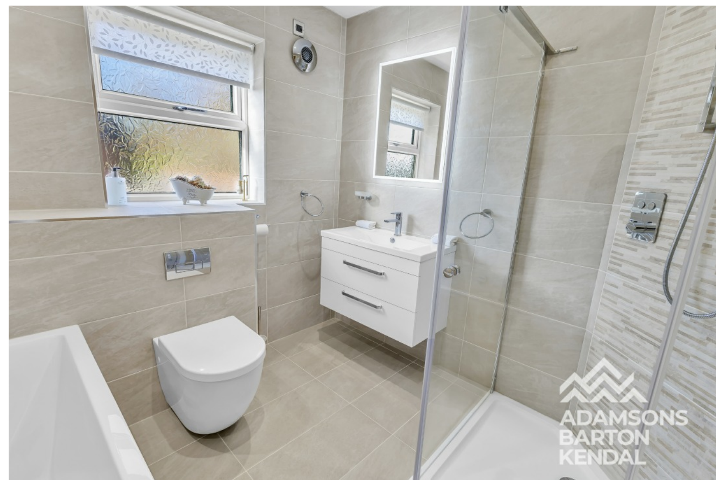
Millbrook Close, Shaw, Oldham OL2 8QA