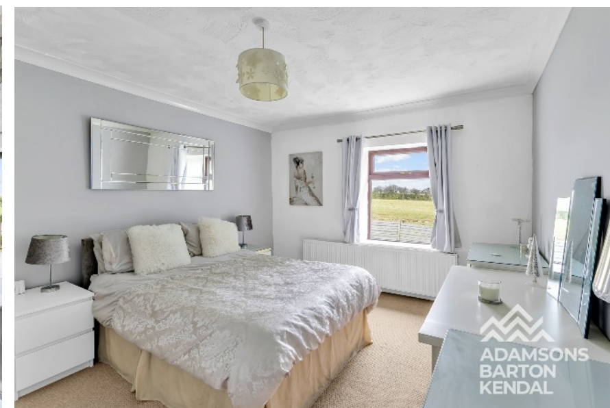
Bryney Heys Farm & Bryney Heys Lodge