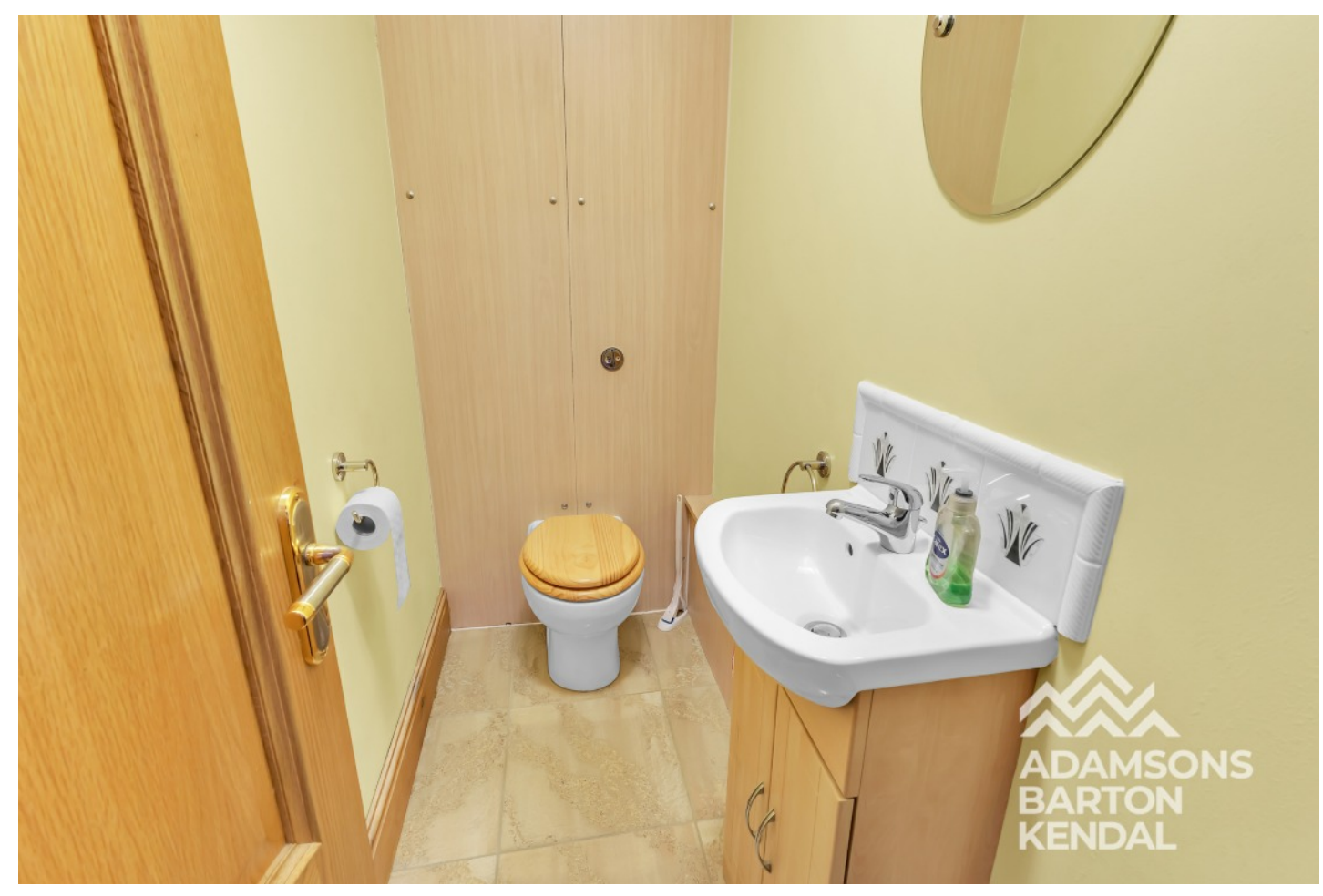
Dundee Lane, Ramsbottom BL0 9HG