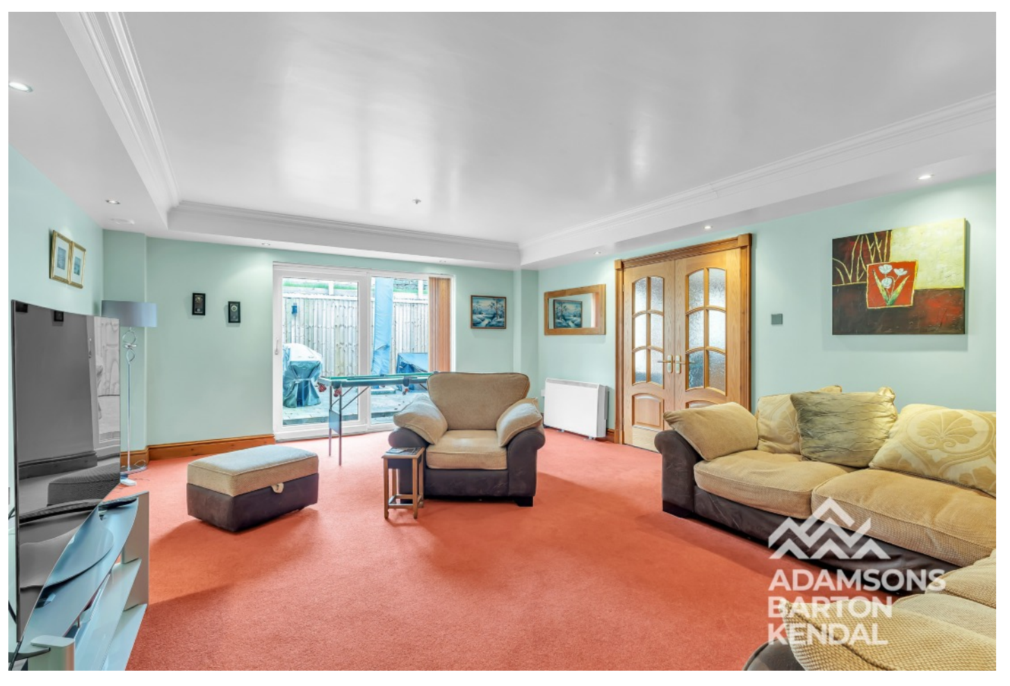
Dundee Lane, Ramsbottom BL0 9HG