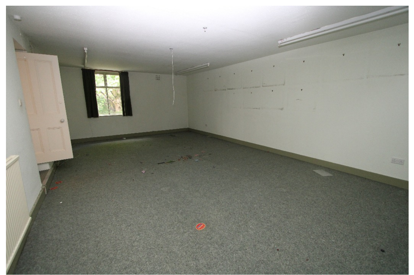
Dewhirst House, off Woodhey Grove, Syke OL12 9TX