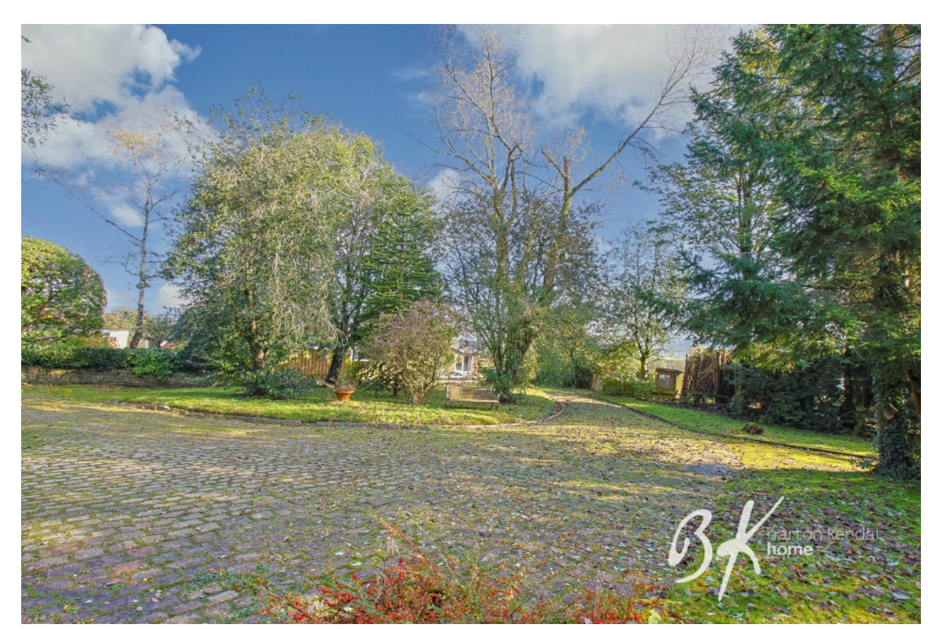
Dewhirst House, off Woodhey Grove, Syke OL12 9TX