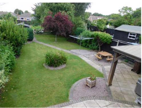
Hall Gate, Holbeach £375,000 Guide Price

14 Church Street, Holbeach, Lincolnshire, PE12 7LL