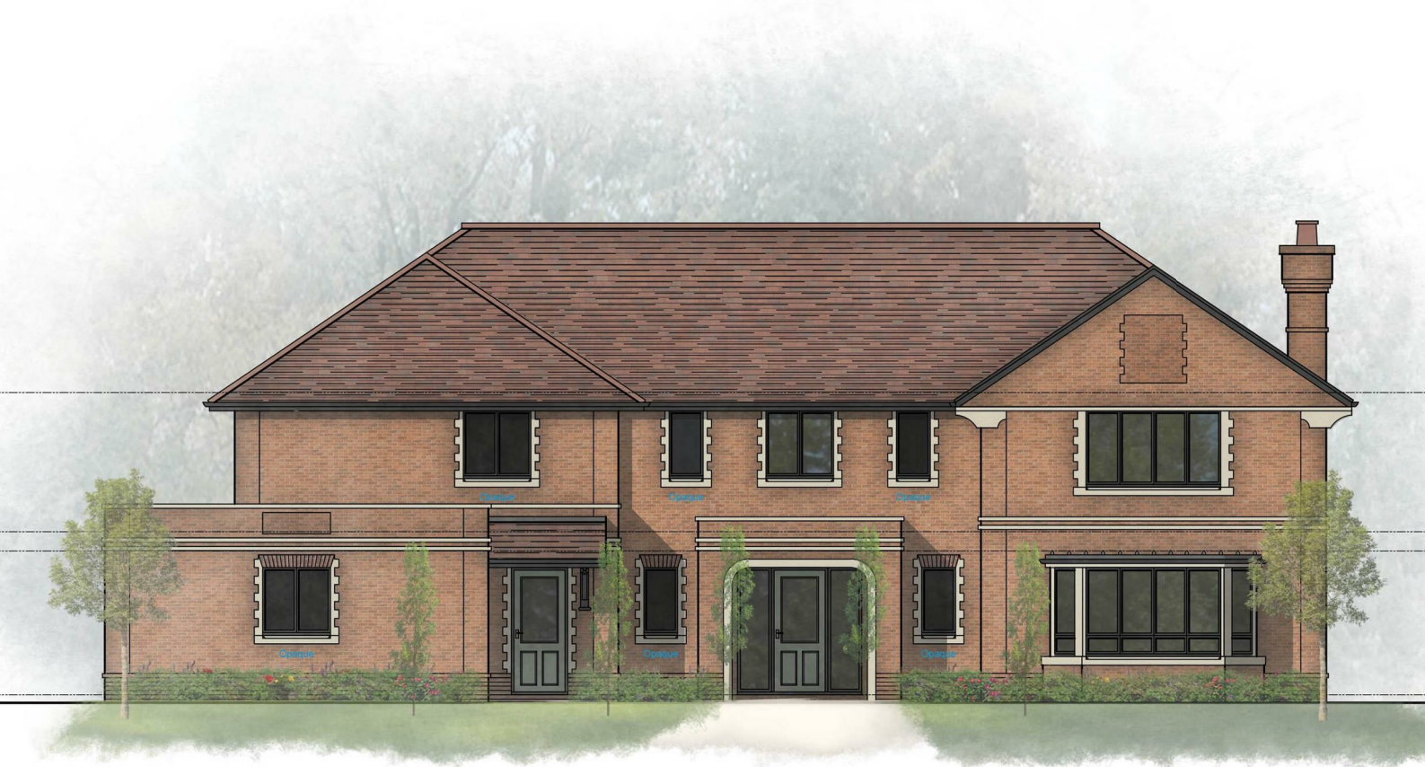
Front Elevation (Facing Northwest)