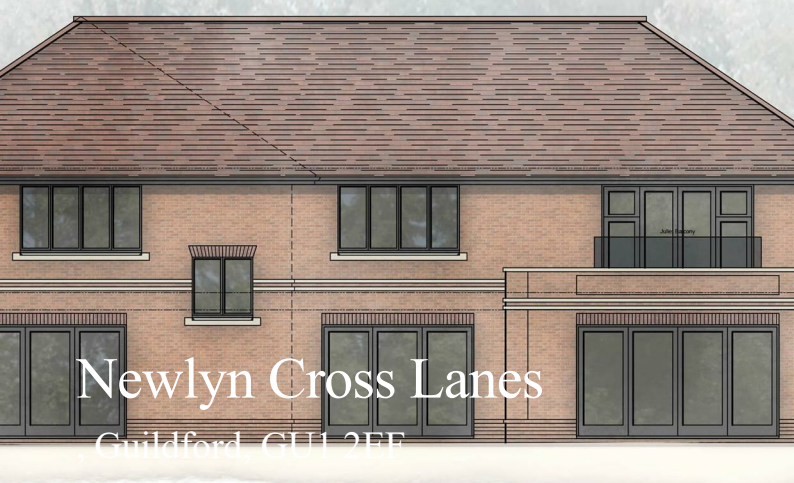
Newlyn Cross Lanes Guildford GU1 2FF