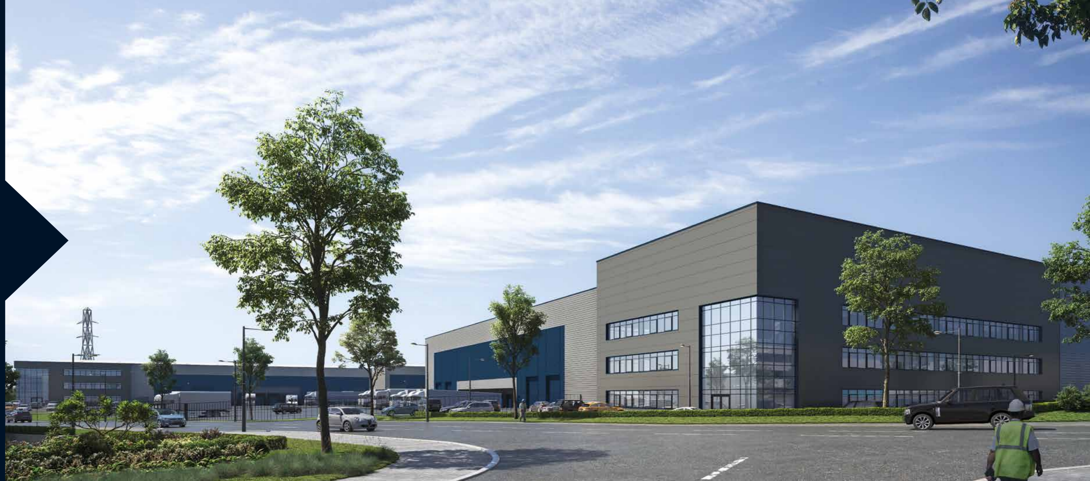
Image for illustration purposes only