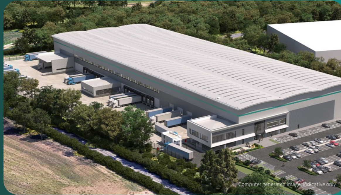
Computer generated image, indicative only

A single Grade A warehouse offering 159,002 sq ft with detailed planning consent for Class Use B2 or B8, including ancillary offices.