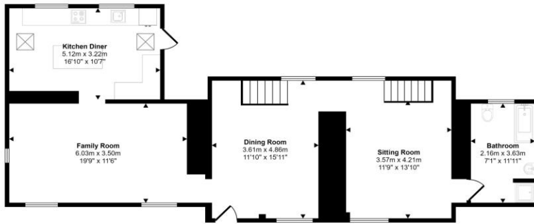
Ground Floor Approx 93 sq m / 1000 sq ft

Approx Gross Internal Area 130 sq m / 1402 sq ft