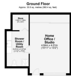
Total area: approx. 33.5 sq. metres (360.4 sq. feet)

The marketing plans shown are for guidance purposes only and are not to be relied on for scale or accuracy.