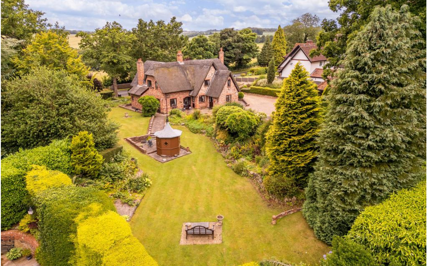
Approx Gross Internal Area 198 sq m / 2134 sq ft