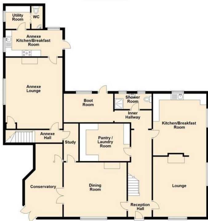
Ground Floor Approx. 0.0 sq. metres (0.0 sq. feet)