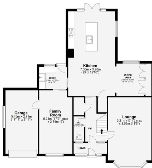
Total area: approx. 190.1 sq. metres (2046.0 sq. feet)

The marketing plans shown are for guidance purposes only and are not to be relied on for scale or accuracy.