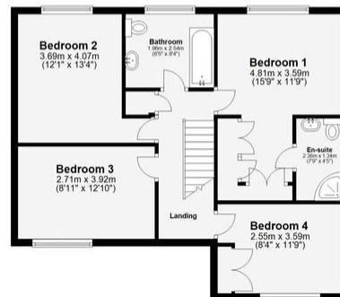
First Floor Approx. 65.9 sq. metres (709.2 sq. feet)

29 – 30 Silver Street Lincoln LN2 1AS 01522 510044